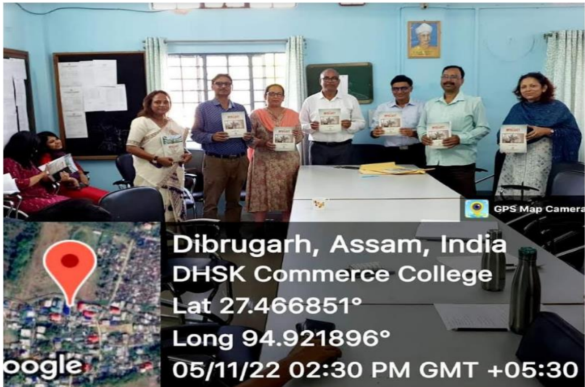
Release of the Research book 'The Insight' published by DHSK Commerce College