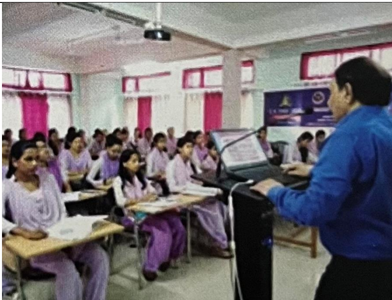
1. Training Program on GST- Women empowerment through Skill Building, organised by Career Counselling Group, ICAI, in association with Dhaarini, Women's Cell DHSKCC On 01-07-2018

Details: The resource person discussed the details regarding GST to empower women with sound knowledge regarding taxes.